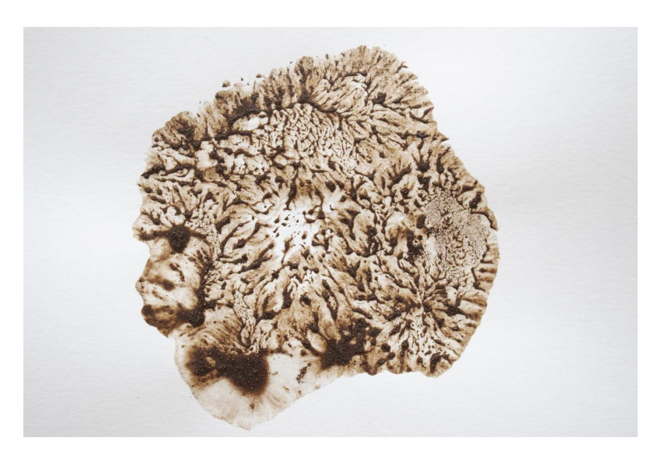
\it mud: when we were \ a \ kiss 2018, imprint of a palm without the fingers, previously coated with mud, on paper, 59,4 x 42 cm