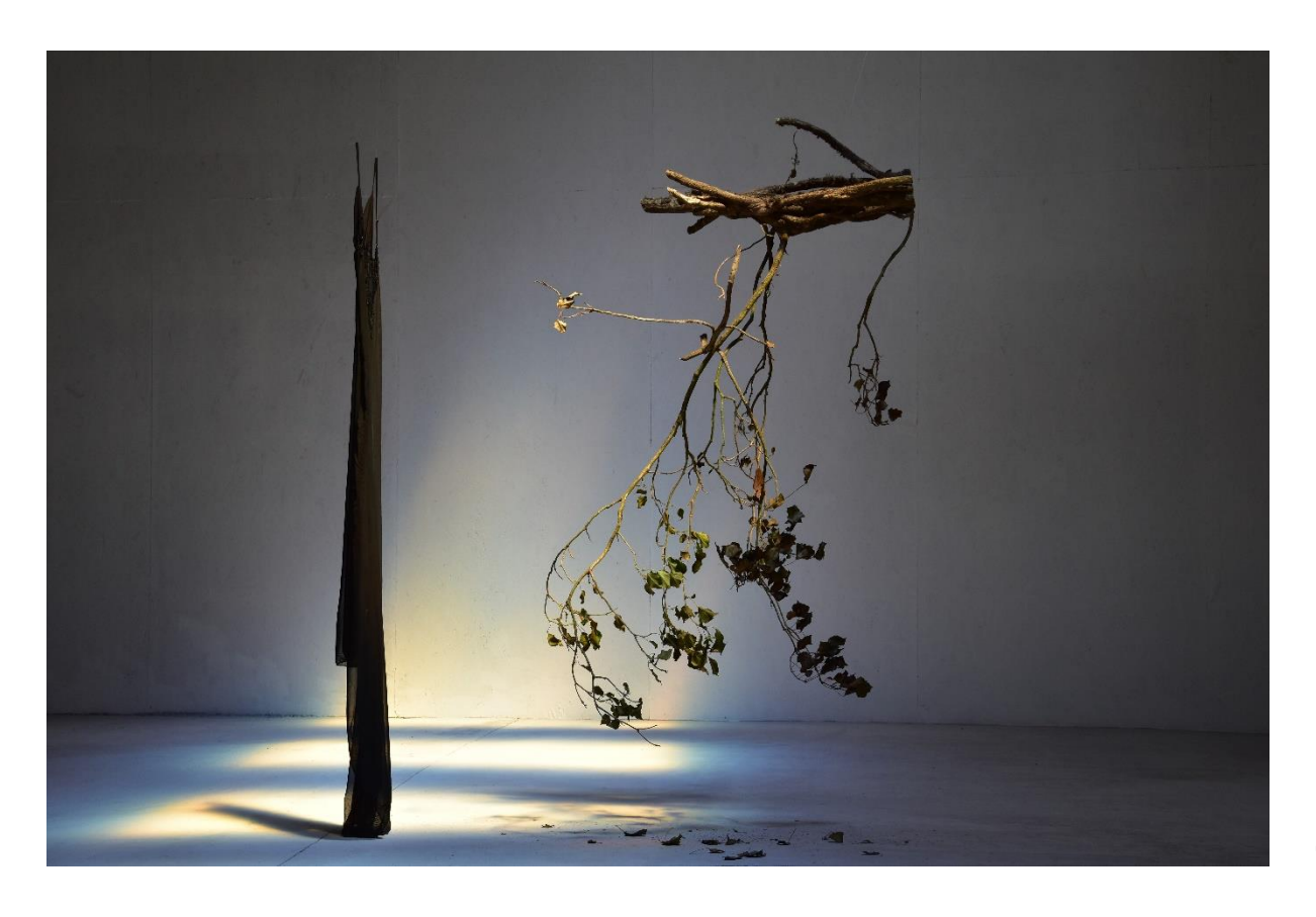
seeing each other, my love, kills us 03.VII.2019, installation, a branch (about 110 \times 170 cm) suspended 190 cm above the ground and a transparent black lace dress (190 x 30 cm), studio view