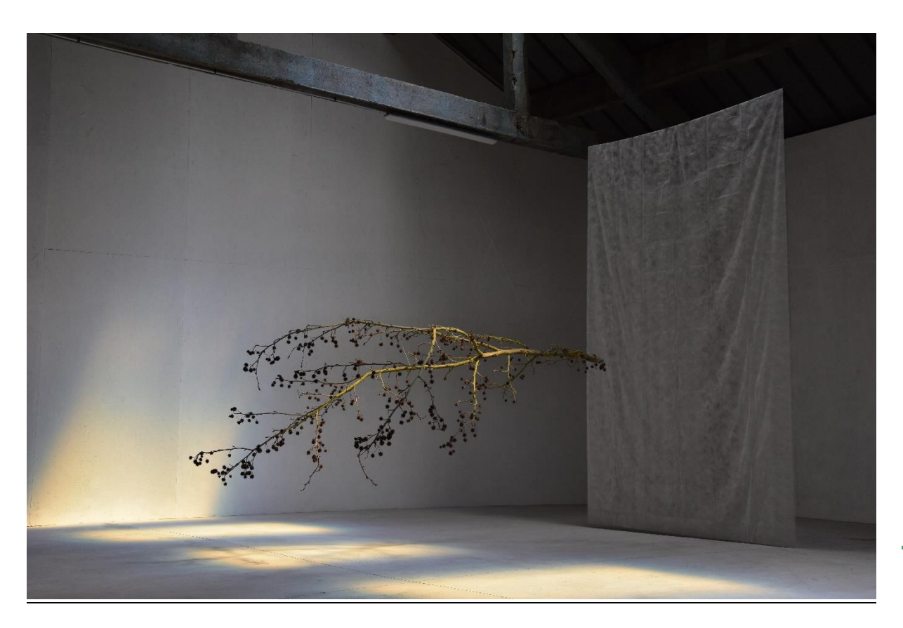
why, my love, did we get divorced? 23.VI.2019, installation, a maple branch (about 180 \times 300 cm) suspended 120 cm above the ground and a growth veil ( 320 \times 200 cm), studio view