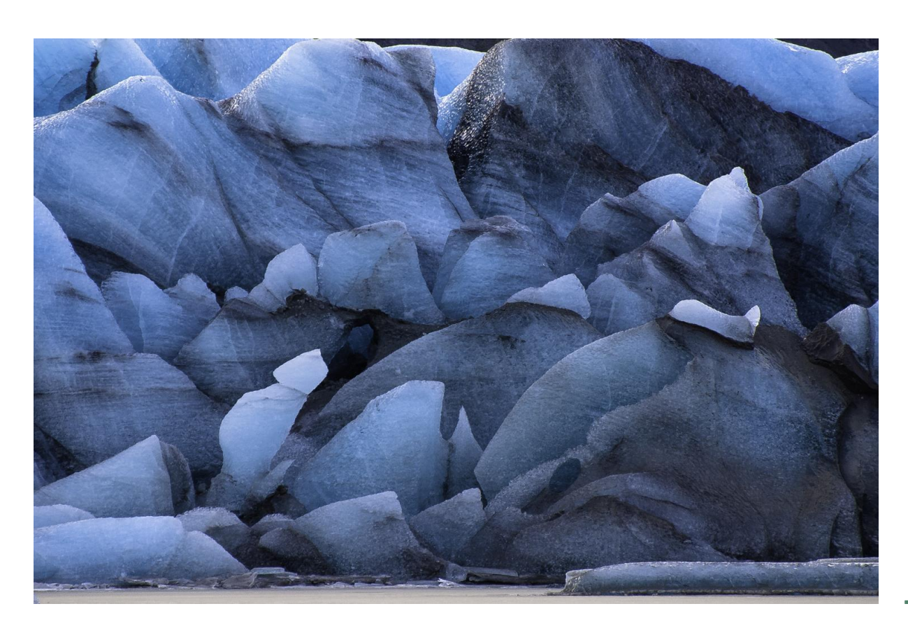
Blue Glacier Front