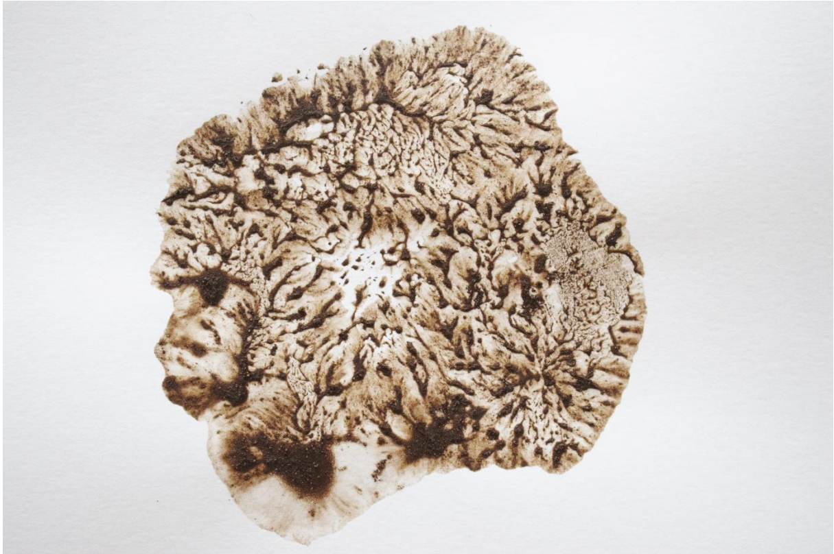
mud: when we were a kiss 2018, imprint of a palm without the fingers, previously coated with mud, on paper, 59,4 x 42 cm