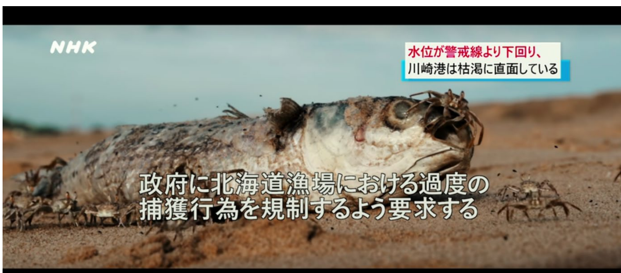
Figure 1: News footage of the environmental crisis (still from The Wandering Earth )

The catastrophe in The Wandering Earth is the Sun's transformation into a red giant, but this distant cosmic event is pulled into the near-future and portrayed in the opening scene through news footage that emulates current climate change coverage.