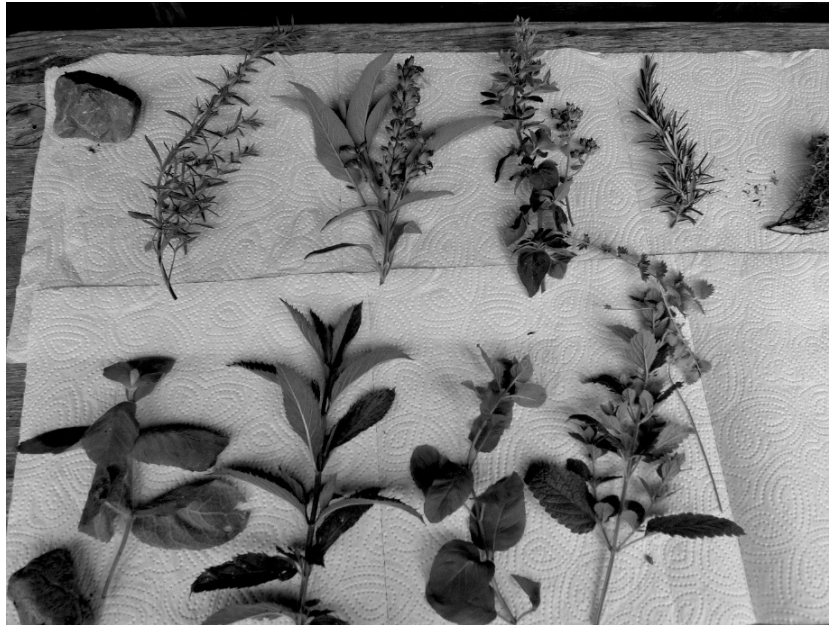
Figure 3: Identifying Herbs in the School Garden ©Bärbel Turner-Hill (2020).

herbs with boiling water. A suitable home assignment of compiling a plurilingual table of herbs, together with an illustration/drawing/ photo and the possible culinary and/or medicinal uses, consolidates this foray into the world of herbs. An excursion to a botanic garden specially designed for medicinal and culinary herbs and particularly adapted to visitors who are visually impaired will serve to further increase the awareness of the many uses of herbs.