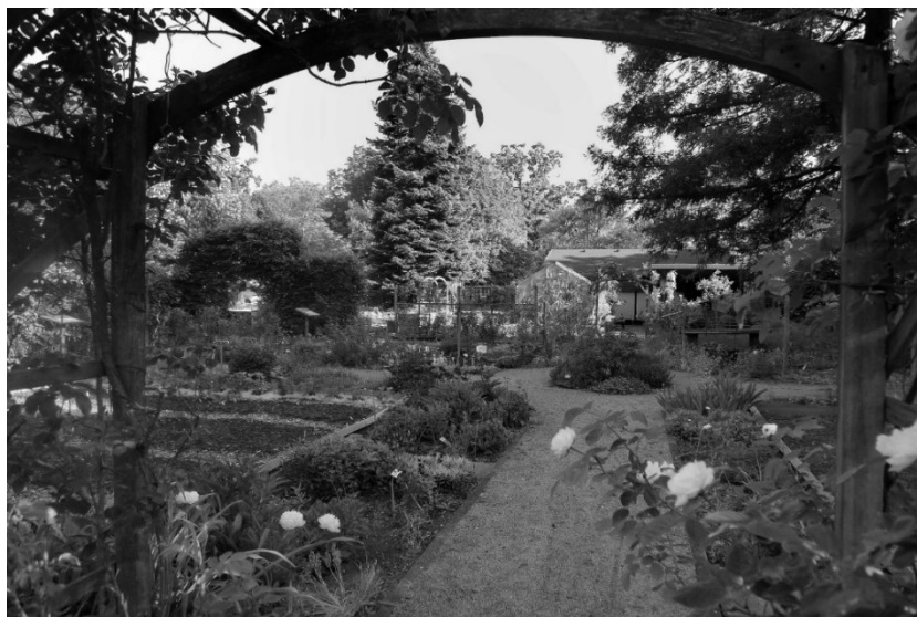
Figure 4: The Ecological School Garden, University of Education Karlsruhe ©Bärbel Turner-Hill (2020).