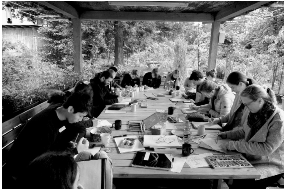
Figure 5: Working in the Green Classroom of the School Garden ©Bärbel Turner-Hill (2019).

This project was developed in cooperation with the Department of Biology of the University of Education Karlsruhe. Traditionally, botanic gardens have always displayed a nomenclature on their trees and plants enabling visitors to not only admire and enjoy nature within a framework of carefully orchestrated collections of plant life, sometimes within a reconstruction of their natural habitat or landscape, but also as reference points for scientists and scholars. Thus, the plant collections serve as living reference material supplying information that can range from the most basic information, the name of the plant or tree in the respective language of the country, to more complex information in Latin which is used as a common global language accepted by international organizations. Often both names, the common name and the Latin name, are displayed.