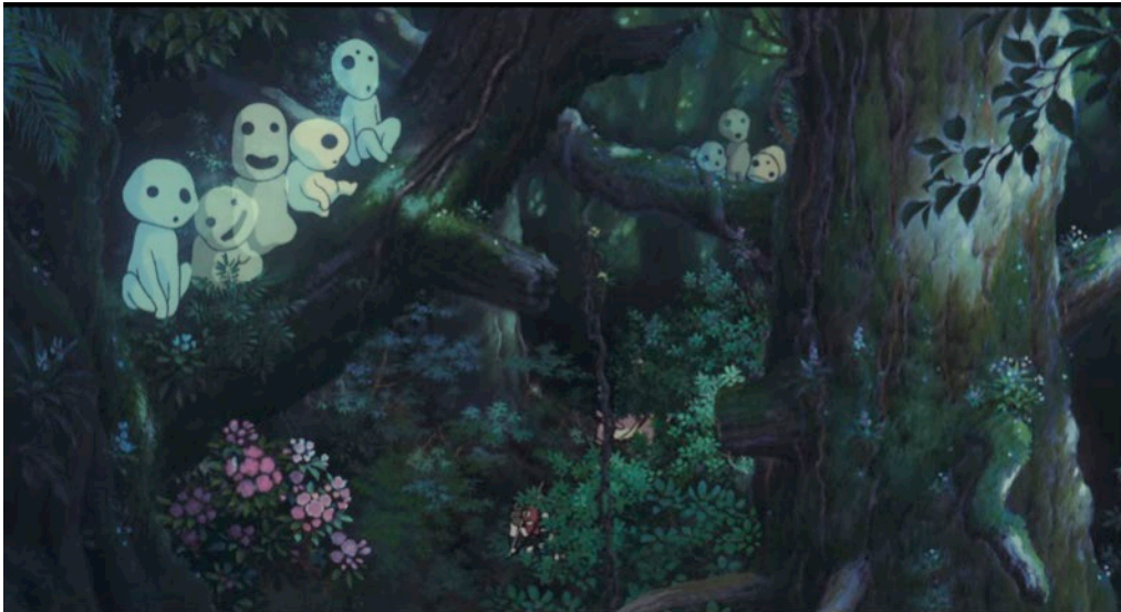
(Figura 1. Varios kodamas, espíritus de los árboles y de los bosques. La princesa Mononoke )

Así ocurre en el ensayo de Ursula K. Heise Plasmatic Nature: Environmentalism and Animated Film (2014); la autora reflexiona sobre la relevancia del cine de animación como género en movimiento, cuyas estrategias estéticas dotan de agencia y de vitalidad a entornos naturales o artificiales, traspasando la idea de los objetos como materiales inertes, y situando este escenario como una posible alternativa a la estética moderna donde proliferan ecosistemas vivos y poblados por todo tipo de agentes no humanos (303).