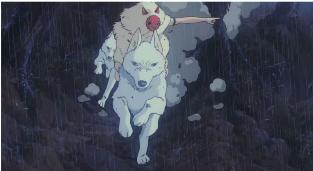
(Figura 3. ¡Ahí vienen, les lobes! La princesa Mononoke )

En tiempos de urgencias , siguiendo la terminología de Haraway, San participa situándose desde el activismo y la heroicidad compartida que en buena medida desarrolla guerreando-junto a le diose lobe Moro. Éste es un activismo que podría entenderse en términos de autodefensa; las acciones de le joven representan líneas de fuga , una salida hacia otros posibles (ver Deleuze y Guattari y Guattari) no sólo dentro de la maquinaria del capitalismo, sino también en un conflicto que se evidencia en la primera aparición de San en escena cuando elle y les lobes irrumpen, descendiendo colina abajo en una noche lluviosa, provocando la caída de la comitiva, que dirigida por Lady Eboshi, transporta enseres y comida hacia la Ciudad del Hierro, ciudad fortaleza donde los trabajadores se dedican a la fundición de hierro para construir armas; arrasan el bosque talando árboles que usan como combustible y extrayendo el mineral. San y les lobes rompen así con el imaginario occidental que tiene al lobo con un animal solitario y a la mujer como un ser destinado a emparejarse.