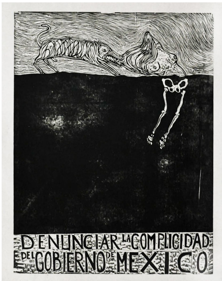
fig. 1: “Denunciar la complicidad del gobierno de México,” ASARO (Asamblea de Artistas Revolucionarios de Oaxaca), 2006, wood engraving print.

“Denounce the complicity of the Mexican government,” revolutionary artist collective ASARO depicts a scavenging dog uncovering the remains of a female human body. The call for denunciation is situated within a growing public recognition of what has increasingly been referred to as an “epidemic” of femicides in Mexico, both internally as well as in the borderlands. This national crisis is compounded by a negligent state that routinely fails or refuses to do its diligence in investigating femicides, especially in instances where public security and legal systems are known to collude with other parties, such as cartels, human traffickers, and US agencies who negotiate and enact coercive binational policies that expose refugees, asylum seekers, and other migrants to deadly risks. Here the denunciation is twofold. The title appeals directly to viewers to participate in demands for accountability, while the scavenging dog’s act constitutes the investigation of a femicide and is itself an act of denunciation.