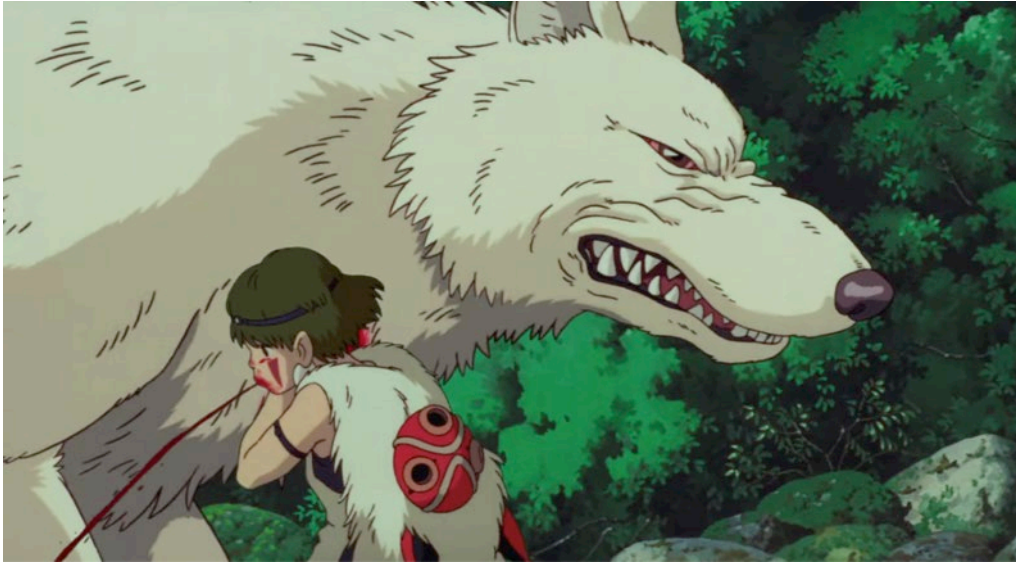
(Figura 2. San curándole la herida a su madre, Moro. La princesa Mononoke )

cortan los árboles?” le pregunta San a Moro (1:26:04) y la interdependencia que se ve encarnada en la vulnerabilidad de los diversos cuerpos (281). Después de que su madre, el lobo Moro, ha quedado malherido, tras la lucha con los vecinos de Ciudad del Hierro, San intenta curarle la herida junto al humedal, succionando y escupiendo su sangre; a su vez, se siente observada.