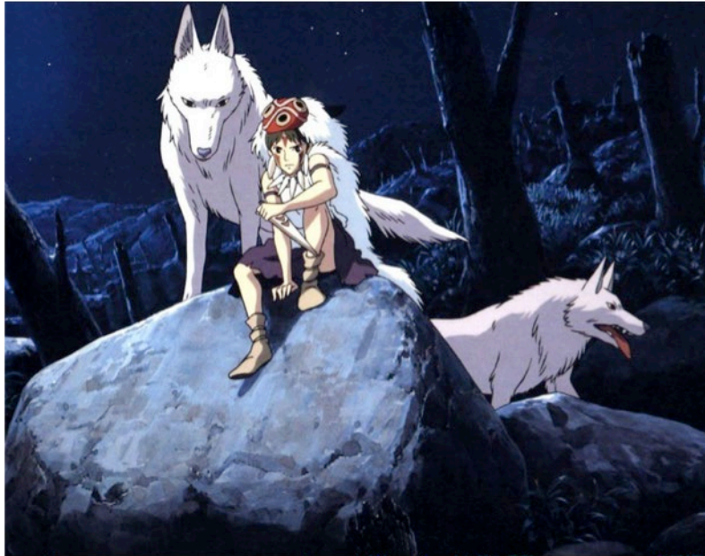
(Figura 5. San, les lobes, las rocas, las estrellas y los árboles. La princesa Mononoke )

1719) de una ficción humanista, protagonizada por un personaje hegemónico de sobra conocido en los entornos de estudio de la economía. Para Pérez Orozco, desde su perspectiva crítica decolonial, Crusoe no muestra una figura inocente, sino el cuerpo oculto del sujeto heroico del desarrollo, que descubre que tiene una tierra desconocida a explorar, a conquistar y a dominar, donde poder generar, él solo, civilización, crecimiento y progreso (58). Frente a él, San no coloniza, ni se apropia, ni domestica, ni domina. Es parte del bosque, se sincroniza y camufla con el entorno en una relación de interdependencia y de cuidados compartidos y recíprocos.