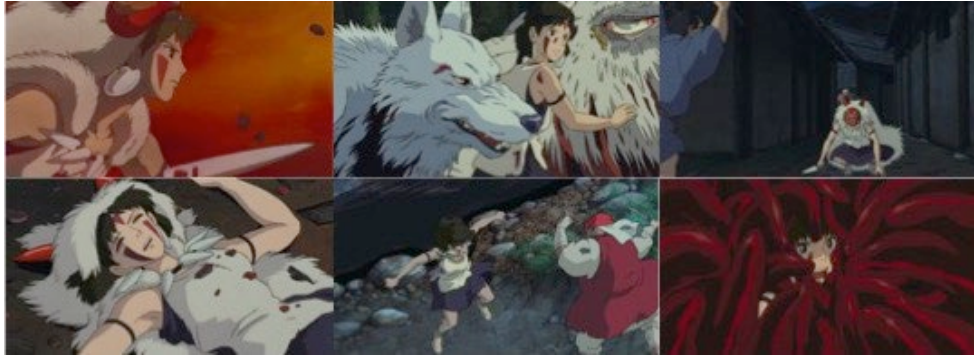
(Figura 4. San a punto de morir. La princesa Mononoke )

Al igual que ellas, San habita en medio de un proceso de industrialización, de generalización del trabajo asalariado y de expansión de las violencias heteropatriarcales. Paradójicamente, en una inmersión de los roles de género, pero reproduciendo las mismas diferencias: recordemos que Lady Eboshi, la patrona de Ciudad del Hierro aspira a colonizar y explotar las tierras del bosque, mientras San piensa en la continuidad del mundo natural y en la cercanía de los otros seres, vivos o no, en el parentesco y en la similitud. San favorece el desarrollo conjunto de la razón y la emoción y abandona lo que el ecofeminismo ha llamado lógica del dominio (Puleo 17).