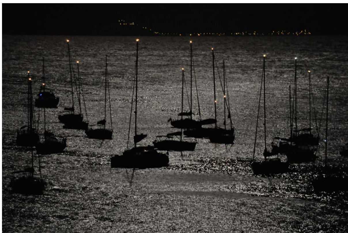
Alberi. Presenze nomadiche. 2 / Trees. Nomadic Presences 2 (Panarea, Aeolian Islands)