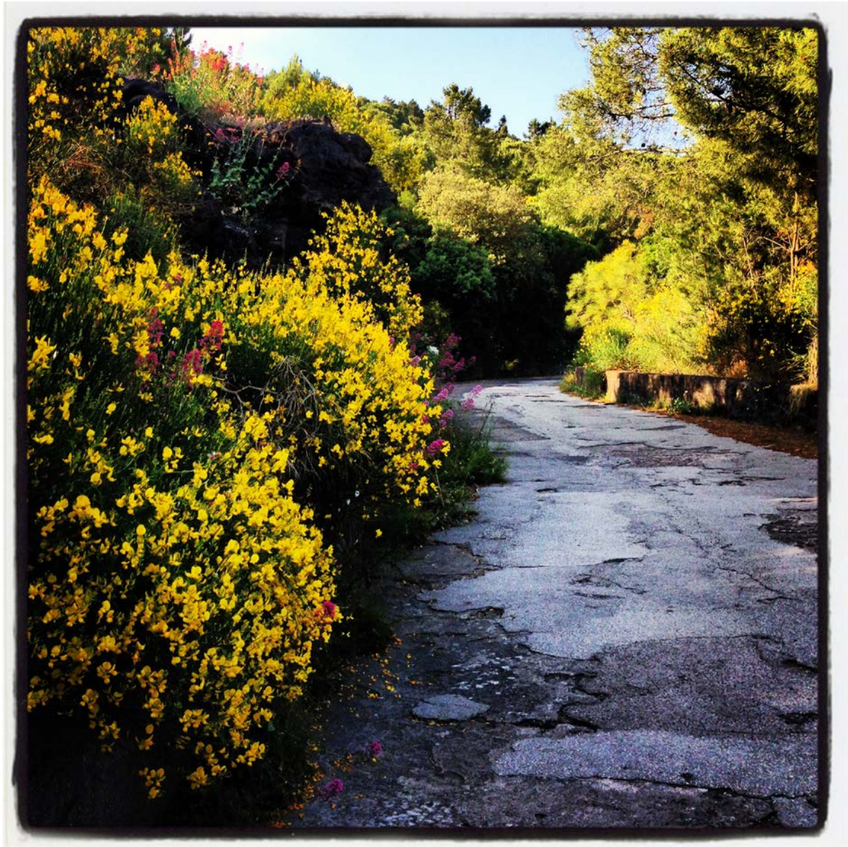
Sciami. / Swarms. (Boscotrecase, Mt. Vesuvius' National Park)