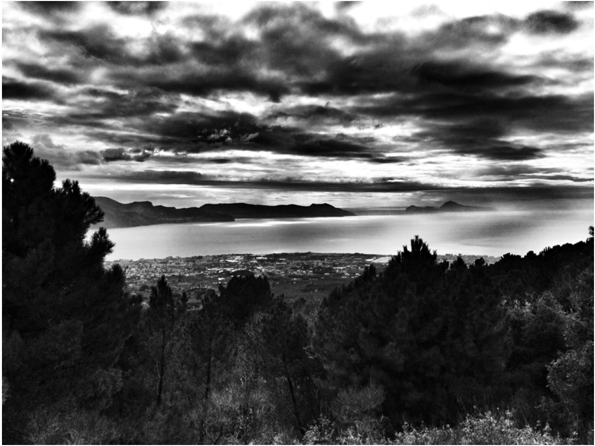
Le onde sopra. / The waves above. (Capri and Sorrento's Peninsula seen from the top of Mt. Vesuvius)