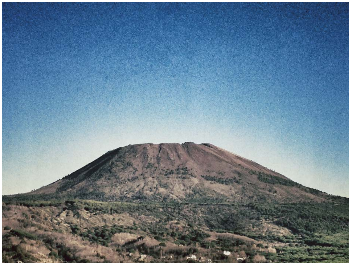
Il sonno della ragione. / The sleep of reason (View of Mt. Vesuvius from Torre del Greco)