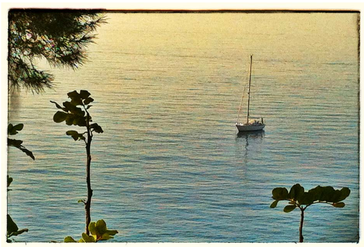
Alberi. Presenze nomadiche. 1 / Trees. Nomadic Presences 1 (Vico Equense)